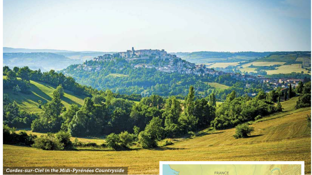
Cordes-sur-Ciel in the Midi-Pyrénées Countryside