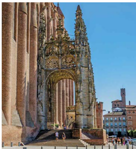
Below: Cathédrale Sainte-Cécile, Albi