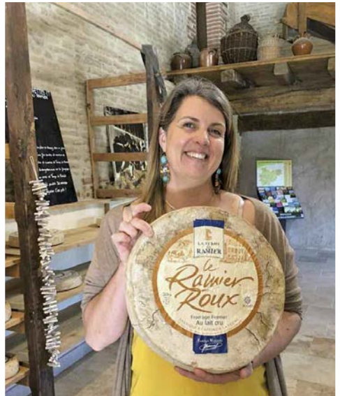
Above: Place Nationale, Montauban Inset: Dairy farm visit, Montauban

Meet the owners of a family-run dairy farm. Managed by two sisters who are passionate about animal welfare, the farm uses both